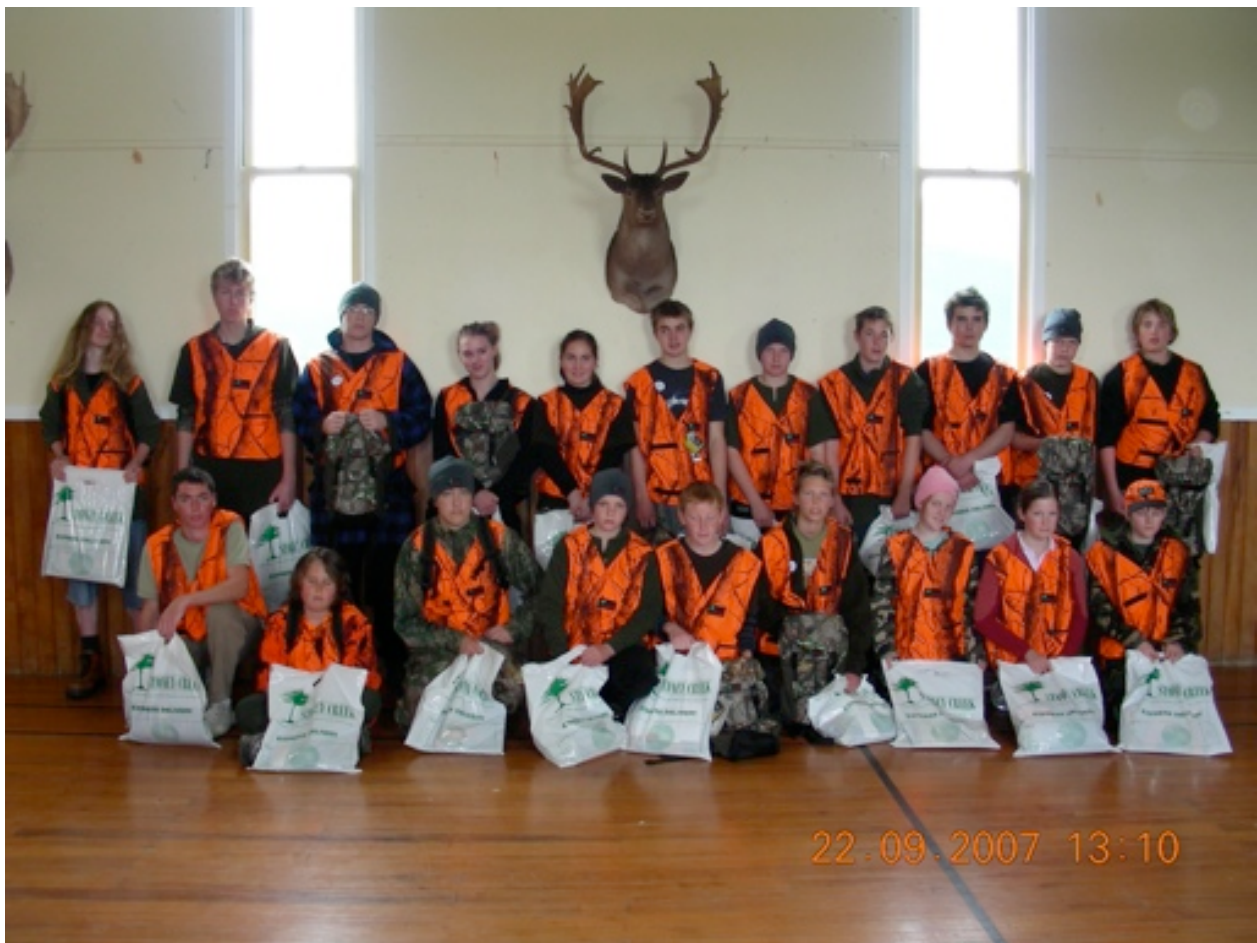
Kids at the Southhead Hall with sponsors kits