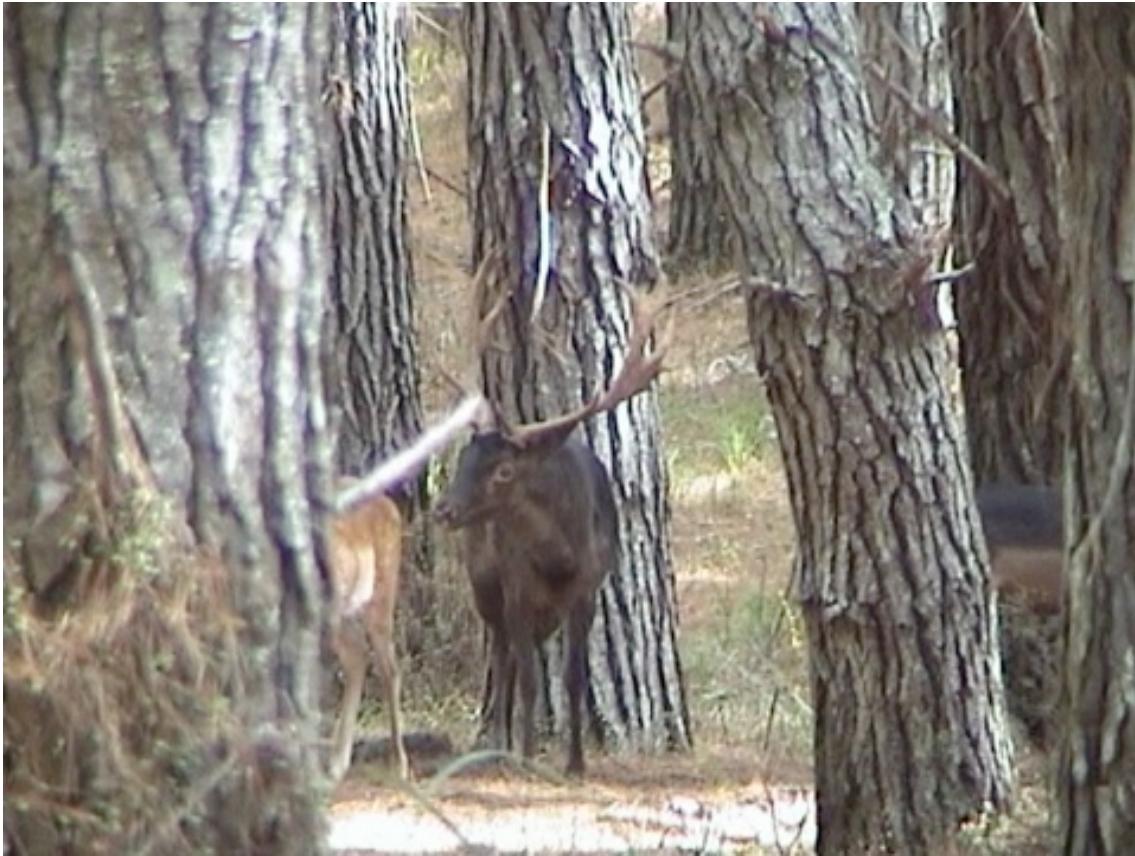
One that got away